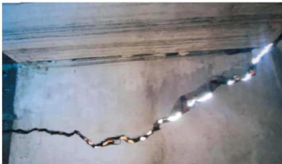
Figure 2: Land disasters caused by underground mining.

Engineering practice: students master the basic theory of deformation monitoring and data processing by studying the previous four modules. But this module is designed to improve students' practical ability. In this module, students on weekends undertake practical work in the area near the school. An example of the result is shown in Figure 2, which deals with monitoring land disasters caused by underground mining.